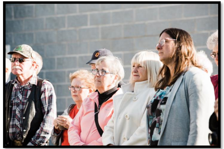
RKCC members at the tree planting ceremony.