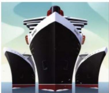
Royal Kingston Curling Club